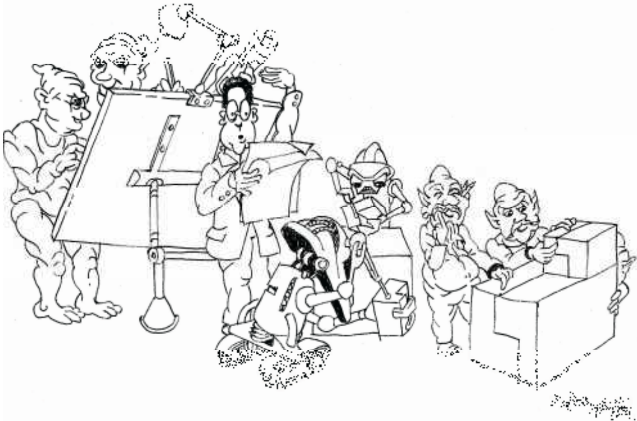
Figure 1 – Solution stakeholders at work

In this book we are continuing the discussion and sharing of best practices, but are focusing specifically on interoperability and integration of similar and dissimilar (heterogeneous) solutions. Rather than specialising on any one concept or technology, this book intentionally presents a “broad scan” introduction to a variety of technologies within that scope.